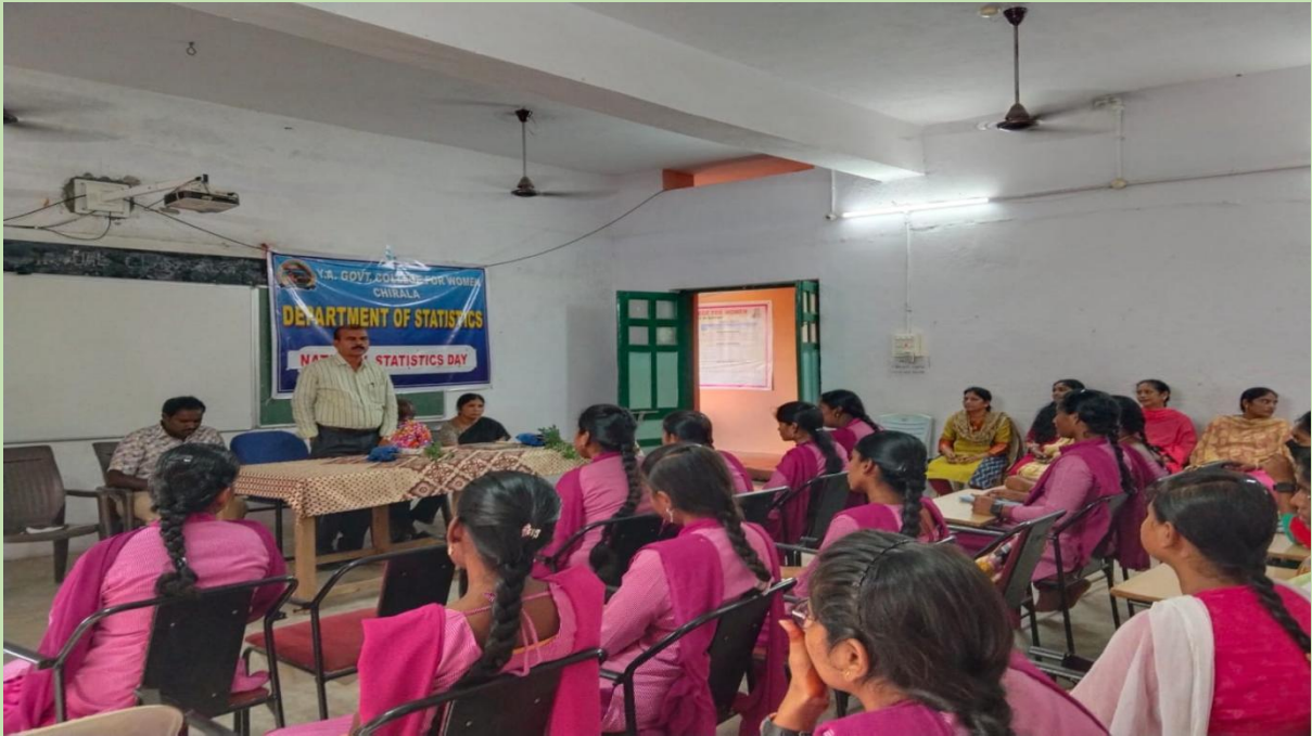
NATIONAL STATISTICS DAY