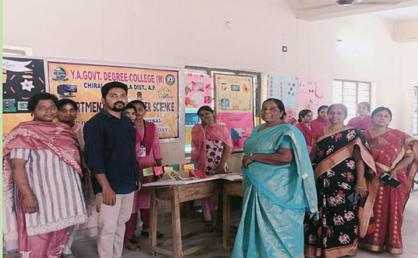
SCIENCE DAY CELEBRATIONS