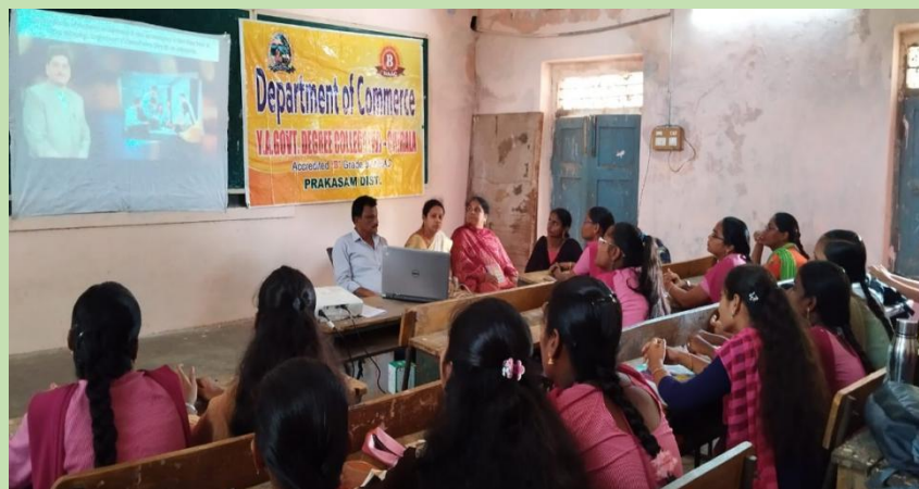
Orientation Programme on Professional Courses