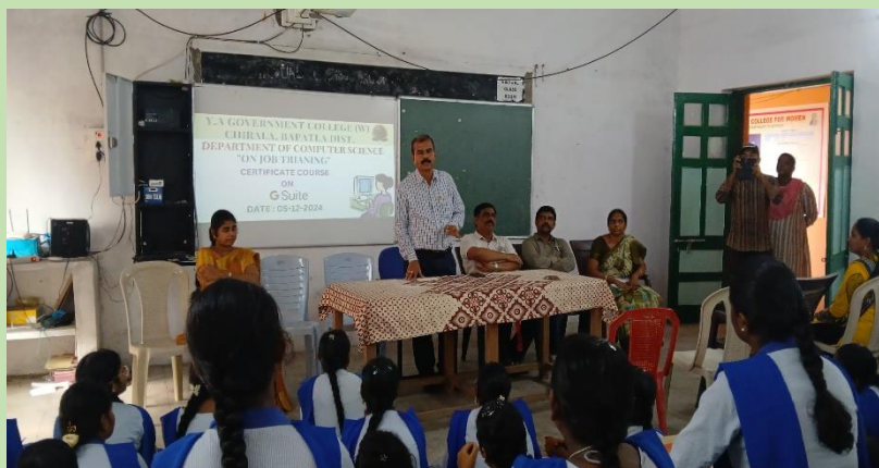
CERTIFICATE COURSE ON G-SUITE