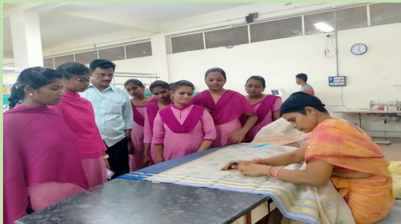
FIELD VISIT TO KSR HANDLOOMS