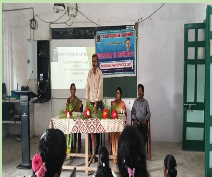
NATIONAL MATHEMATICS DAY