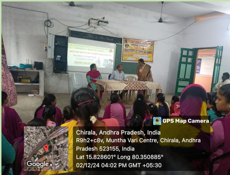
COMPUTER LITERACY DAY